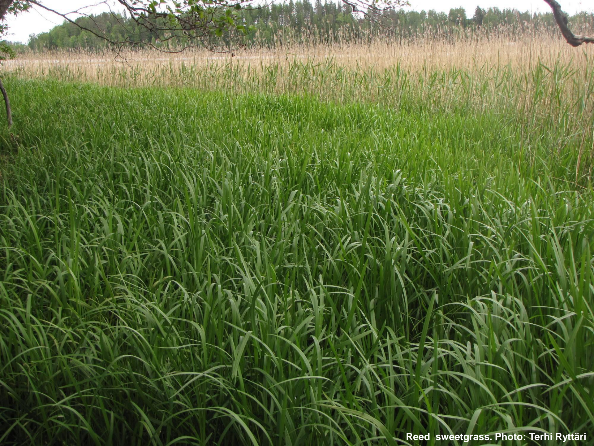
Reed sweetgrass.